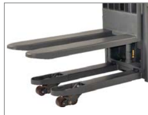
Option: Initial lifting with double-pallet