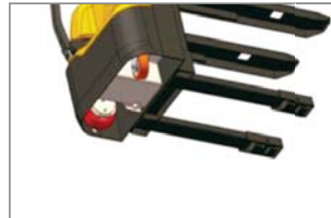
4 point design, improve the trucks stability.