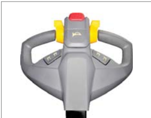
RUYI Tiller Head